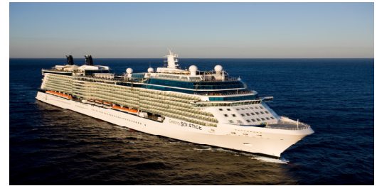
THE CRUISE VACATION OF A LIFETIME!

* An amazing 17-days, for less than the price of 12!