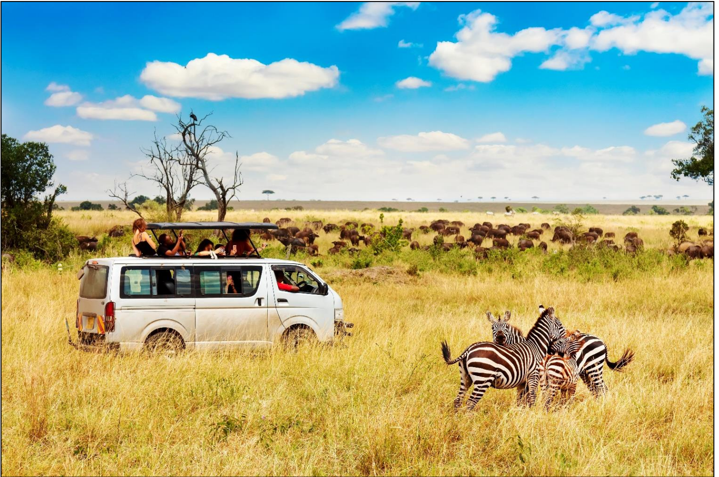
On safari with Brian Judd Tours