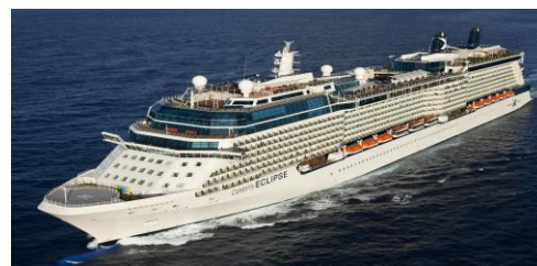
THE CRUISE VACATION OF A LIFETIME!

* An amazing 18-days, for less than the price of 12 – an outstanding value!